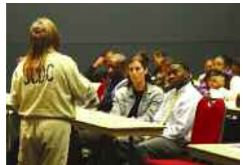
Workshop at the annual JAG-SC Leadership Conference in Columbia, February 2007.

“Being a part of JAG-SC has made me feel like I have a purpose for living. JAG-SC has made a change in my behavior and my attitude.”