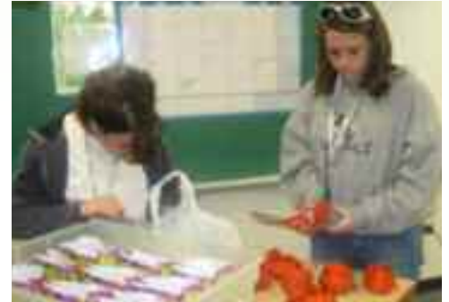
YMCA Halloween Festival—Rock Hill High School

Students also perform community service. Over the course of the first two pilot years, the average student gave 36 hours to his/her community through activities such as visiting nursing homes, maintaining the cleanliness of local highways, bringing “Teddy Bears of Love” to the patients of McLeod Children’s Hospital and facilitating games and activities for young children at the YMCA on Halloween.