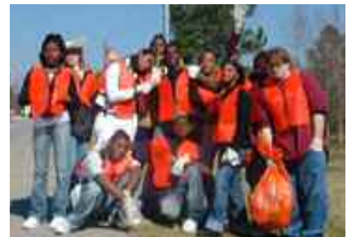
Adopt-A-Highway Project—Manning High School