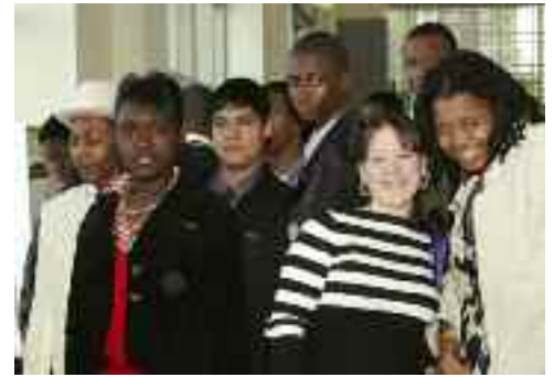
Participants at the annual JAG-SC Leadership Conference held in Columbia, February 2007.

T he initial two years of the five-year pilot program have proved to be successful for the Jobs for America's Graduates-South Carolina (JAG-SC) students, with 95% of them staying in school. After two years in the program, JAG-SC tenth graders have reduced their absences by 41%, and their suspensions by 35% on average. In addition, JAG-SC students increased their GPA by at least 9% each year and passed 6% more classes.