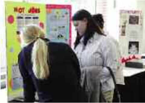
JAG-SC students peruse career information booths at the annual JAG-SC Leadership Conference in Columbia, February 2007.

J obs for America's Graduates-South Carolina's (JAG-SC) focus on fostering academic success is supplemented by a strong career-readiness component. A core employability skills curriculum is reinforced through developing business partnerships and providing opportunities for students such as internships, mentoring, guest speakers and summer and post-graduation employment options.